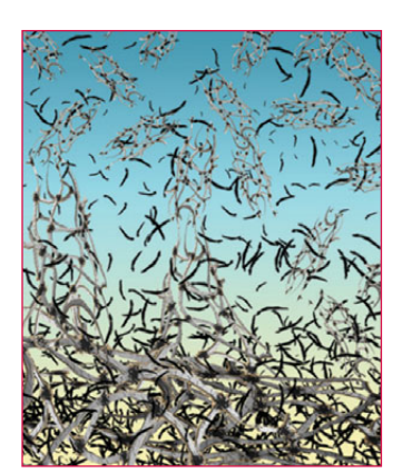
The elastomer dispersion acts as a 'spacer' in the thermoplastic

In addition, they act as a 'spacer' between molecules, increasing the intermolecular spacing of a plastic and decreasing the cohesive intermolecular bond, thus making the material softer and flexible. This softening is shown by the decrease in the material's glass transition